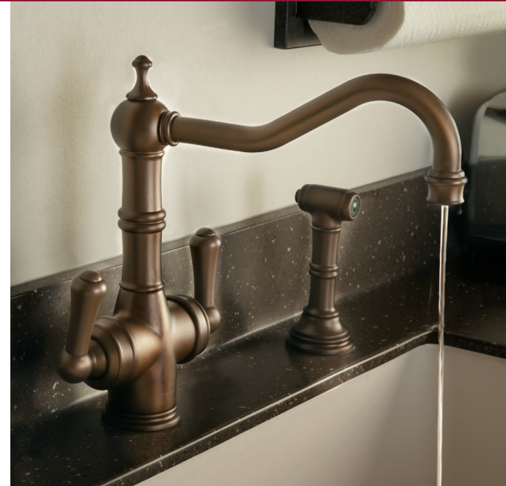
Fresh, filtered water is delivered via a separate, hidden waterway inside the faucet.