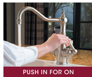
PUSH IN FOR ON