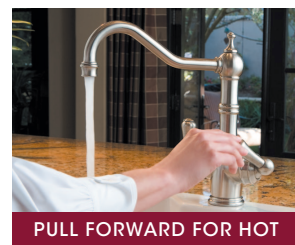
PULL FORWARD FOR HOT