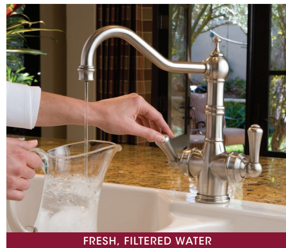
FRESH, FILTERED WATER

faucet allows you the freedom to drink, brush and rinse with fresh, filtered water every day. The ROHL Perrin & Rowe® Filtration featuring “Triflow® Technology” is the functional, stylish answer for obtaining healthy, filtered water without compromise.