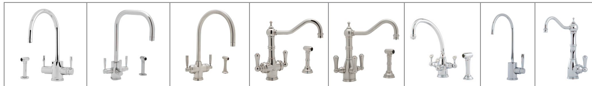
U.1293LS U.1292LS (without sidespray) U.1192LS (bar faucet)