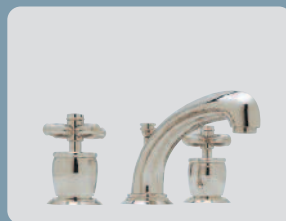
- Polished Nickel - MB1929XM shown