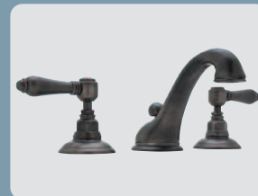
- Old Iron - A1408LM shown (Country Bath Viaggio Series only)