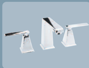
- Polished Chrome - A1008LV shown