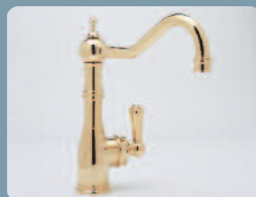
- Inca Brass - U.4741 shown