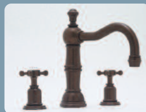
- English Bronze - U.3721X shown