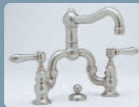
- Satin Nickel - A1419LM shown