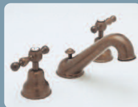
- Tuscan Brass - AC102L shown