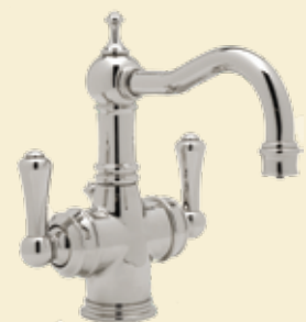
Traditional Lavatory Faucet (U.1370LS)