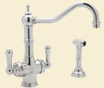
Traditional Kitchen Faucet (U.1570LS)

According to Gray, tap water is often riddled with contaminants, especially in the Long Island area. The IFF System provides an elegant way to address those concerns by offering not only a design solution, but fresh, filtered water that families can feel confident consuming. Mary also attributes the success of the IFF Collection to the fact that the Katadyn filter cartridges are reasonably priced and very easy to change out. Consumers are usually not aware of how much they spend on bottled water and above-the-counter filter contraptions. “It's easy for me to convey the value proposition of the ROHL IFF Collection to my clients – it tends to be an easy sell!”