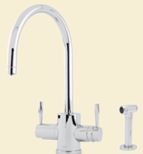
Contemporary Kitchen Faucet (U.1293LS)