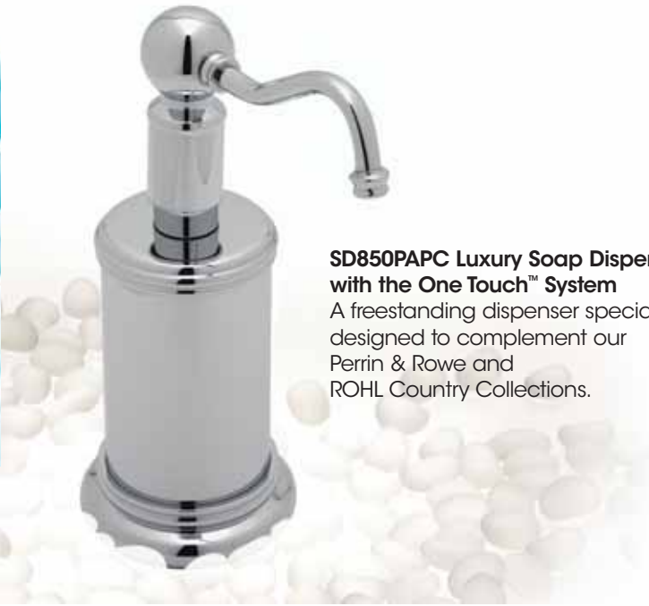
SD850PAPC Luxury Soap Dispenser with the One Touch™ System A freestanding dispenser specially designed to complement our Perrin & Rowe and ROHL Country Collections.