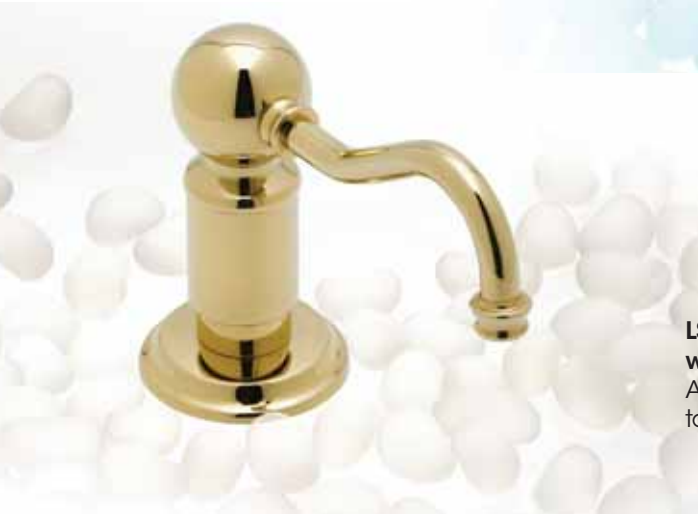
LS850PIB Luxury Soap Dispenser with the One Touch™ System A deck mounted dispenser specially designed to complement our Perrin & Rowe Collection.