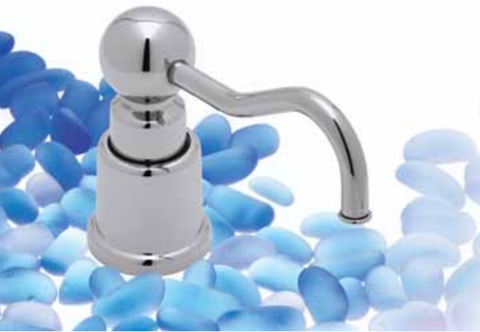
LS650CAPC Luxury Soap Dispenser with the One Touch™ System A deck mounted dispenser specially designed to complement our ROHL Country Collection.

Our Luxury Soap Dispensers are available in a diverse palette of finishes that complement any design theme. These finishes include: Polished Chrome, Polished Nickel, Satin Nickel, Inca Brass, Tuscan Brass and English Bronze