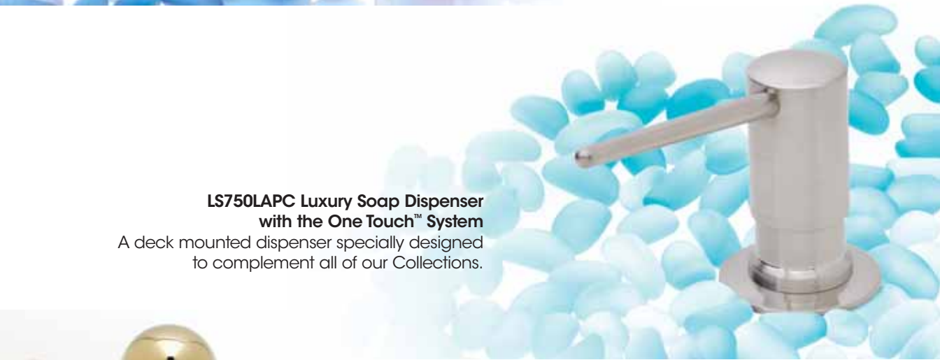
LS750LAPC Luxury Soap Dispenser with the One Touch™ System A deck mounted dispenser specially designed to complement all of our Collections.