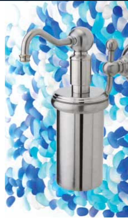
WD850PSTN Luxury Soap Dispenser with the One Touch™ System A wall mounted dispenser specially designed to complement our Perrin & Rowe and ROHL Country Collections.