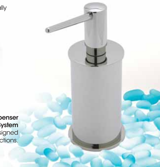
SD550AAPC Luxury Soap Dispenser with the One Touch™ System A freestanding dispenser specially designed to complement all of our Collections.